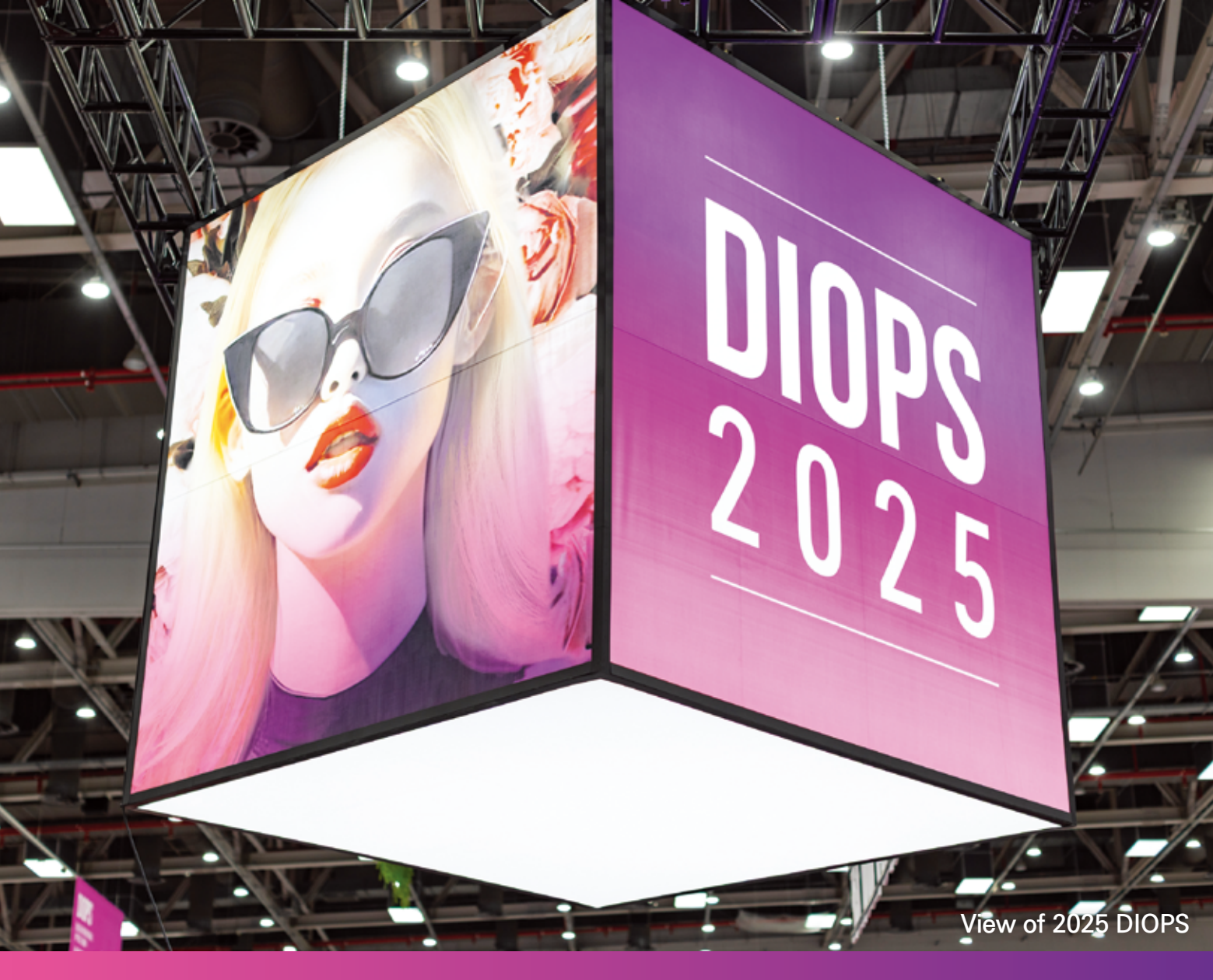
View of 2025 DIOPS